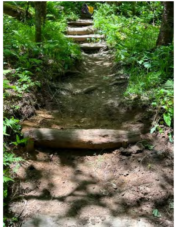
A problematic area....

6/3 - Pete Berntsen, Patti Grady, Beth Buffkin, James Wedekind - Indian Gap/Rd Pr Tr to Rd Prng/Tom Prng Lead - Added five new steps; replaced one waterbar; removed at least four trip hazards; dug up and lowered and/or turned 7 steps; moved a leaning tree so that hikers don't have to duck under it; filled in a step; removed log and knocked down berm and then moved this log up near another step; widened and removed obstruction rocks from ten feet of trail; moved a log deeper into bank and reset; reset multiple stakes; added a rock step below a log step.