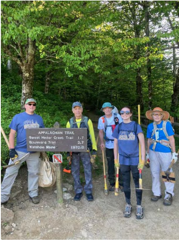
The Monroe/Snyder crew at Newfound Gap