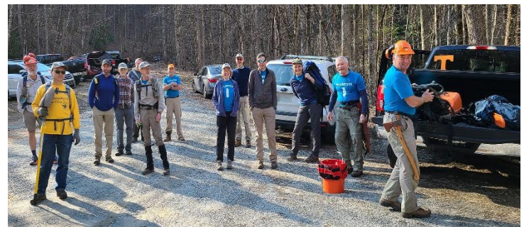
The March 5 work day crew!

used dirt from the opposite bank to fill in around the rocks and allow hikers to easily traverse the area. Other work between Cody Gap and Hogback Gap included stabilizing a few rocks by removing and replacing/resetting the rocks. We added one large rock step across the trail near another rocky area and filled in behind with wet soil that will probably pack down and need a small amount of fill. We improved drainage below the added rock. We added one rock step in front of and lower than an existing tree root. We cleaned out a couple of other small water drains. We had a very good day; accomplished tasks and had no injuries!